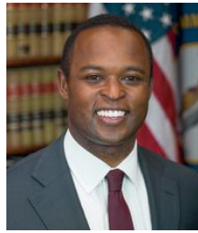
Daniel Cameron (R)