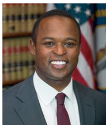
Daniel Cameron (R)