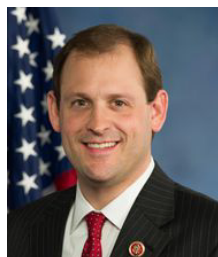
Andy Barr (R)

The information below was compiled from public statements and a candidate questionnaire distributed by the Commonwealth Policy Center, a nonprofit, nonpartisan Kentucky organization.