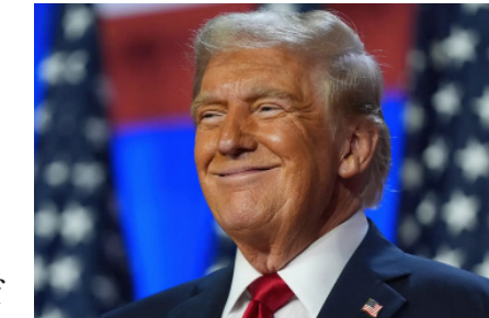
President-Elect Donald J. Trump.