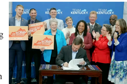
Gov. Beshear signs executive order with LGBT activists on September 18th.

So what exactly is conversion therapy? Simply put, it's a controversial technique where counselors employ abusive practices to force change on those struggling with various sexual orientations. It is questionable as to whether the debunked technique is taking place here in Kentucky. The definition is now broadened. But the rare and egregious practice is being used as a vehicle of excuse to discredit legitimate