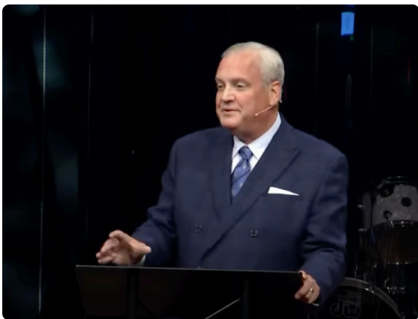
Dr. Albert Mohler presenting on “Honoring God in a Culture That Celebrates Sin” in Bowling Green on February 8th.