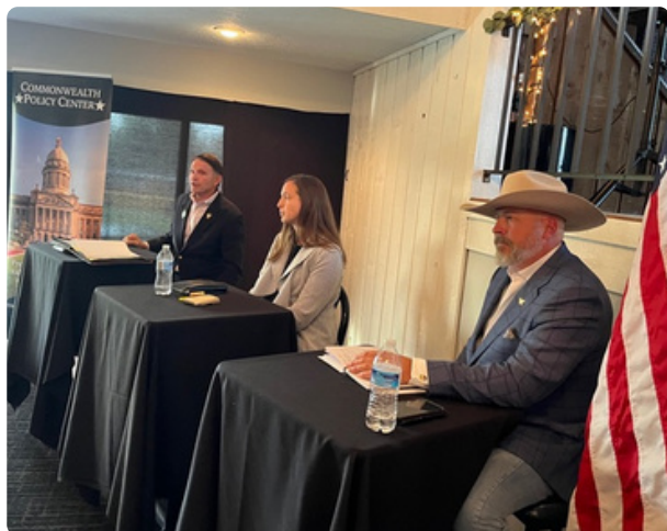
CPC's Candidate Forum for Senate Dist. 17 in Shelbyville on April 25th.