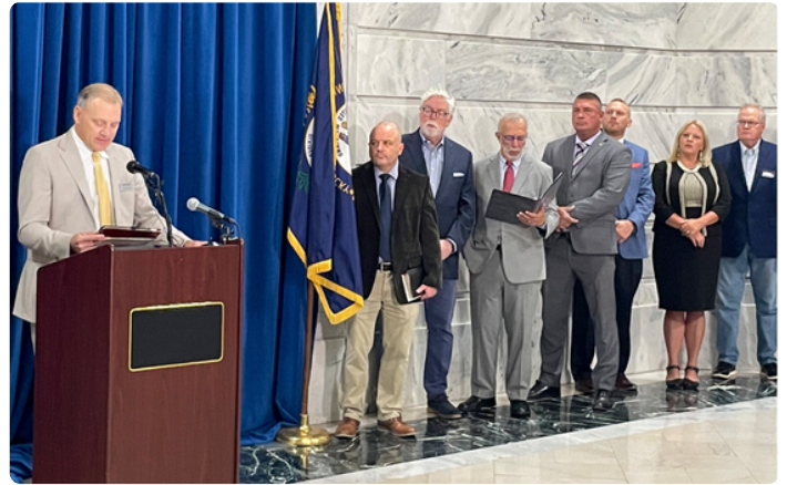
CPC hosted a press conference at the Capitol on September 20th to respond to Gov. Beshear's executive order banning "conversion therapy."