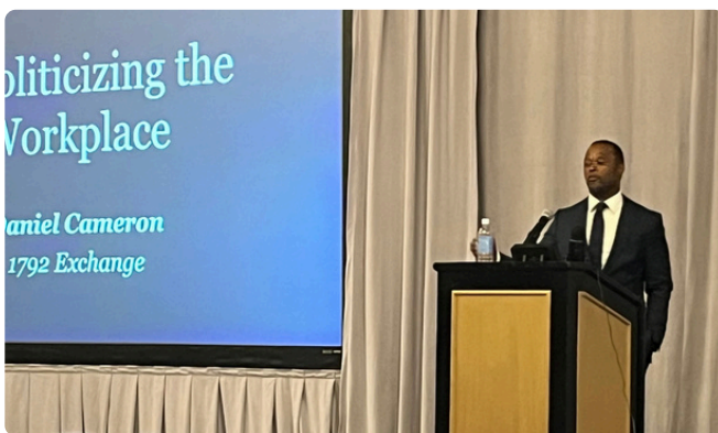
Former Kentucky Attorney General Daniel Cameron spoke on “Depoliticizing the Workplace.”