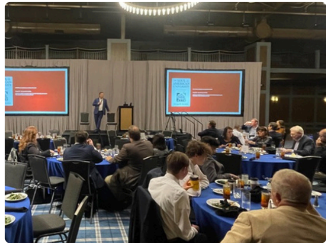
Former Congressman Dave Brat (R-VA) gave the keynote address at Towards a Better Bluegrass Conference on October 18th.

On October 18, CPC hosted over 150 legislators and business and community leaders in Lexington for an all-day conference focusing on our fourth pillar: fiscal responsibility. “Towards a Better Bluegrass: Sources of Kentucky’s Economic Strength” featured speakers and panels on a diverse array of topics such as family-friendly tax policy, the economic benefits of school choice, and pushing back against DEI and ESG programs in business. The conference helped attendees think through how to be faithful and productive in their businesses and advocate for public policy that allows for economic flourishing in their families and communities.