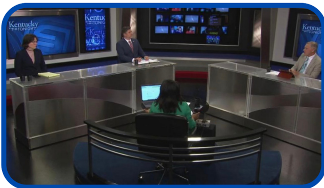
Nelson on KET Tonight discussing SB 150 on June 19th.

CPC had great success this past legislative session, which ran from January to March. In the 30 working days, we strongly advocated for SB 5, SB 150, and HB 594. SB 5 gave parents recourse to remove inappropriate material in public schools. SB 150 was a sweeping omnibus bill that protects Kentucky's children from the harmful effects of the LGBT agenda. The law protects Kentucky school kids from controversial LGBT indoctrination in K-12 public school classrooms, makes clear that bathroom and locker room policy corresponds to biological sex, and prohibits gender transitions of minors. The bill initially passed both chambers and the Republican super-majority was able to override Gov. Beshear's veto. Our advocacy for SB 150 included working directly with legislators to ensure its passage, writing and publishing an op-ed in Kentucky Today , appearing on KET's Kentucky Tonight , leading a petition drive to encourage the legislature and to override Beshear's veto.