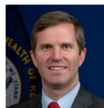
Andy Beshear (D)