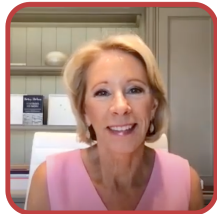
Former US Secretary of Education Betsy DeVos joined us on August 30th.