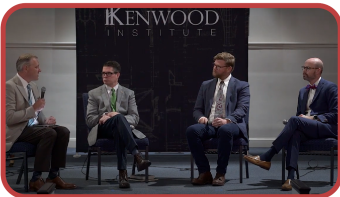
Q&A Segment of the Christian Nationalism Conference.