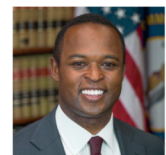
Daniel Cameron (R)

The information below was compiled from official actions and a candidate questionnaire distributed by the Commonwealth Policy Center, a nonprofit, nonpartisan Kentucky organization.