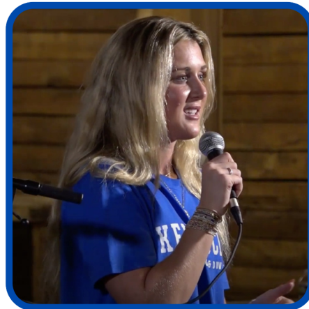
Riley Gaines speaks at a CP PAC Fundraising Event in Bowling Green on September 27th.