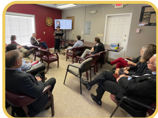
Pro-Life Legislative Briefing at the CPC Office on Dec. 11th.

After the 2023 elections, some Republicans see abortion as a losing issue and are advocating for exceptions in Kentucky's pro-life laws. CPC is leading the charge in this next legislative session to defend our strong laws and protect all unborn life, regardless of the circumstances of conception. We held a legislative briefing with the pro-life caucus on the consequences of implementing exceptions in our office on December 11th.