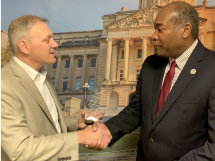
Sen. Don Douglas Receives Friend of the Commonwealth Award

The Commonwealth Policy Center honored legislators with their 2022 Friend of the Commonwealth award. This goes to state House and Senate members who are dedicated to upholding conservative values that make the commonwealth a better place to live and raise a family.