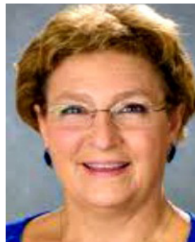
Pam Sigler (D-Lexington)

4 Voted no for HB 416 (02-27-13) (House Committee Substitute) which expanded gambling in Kentucky. It created two new lottery games and expanded casino video slot machines to horse tracks under the auspices of shoring up the state pension fund. It passed the House 52-47 (2-27-13). It was rejected by the Senate on the grounds of being unconstitutional. Source: www.lrc.ky.gov/record/13rs/hb416.htm